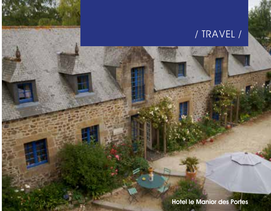
Hotel le Manoir des Portes

A short walk later, we see a familiar beacon on the rocky shore. We are back in Port Dahouet, where the journey began. We have clocked up just over 100 kilometres. It's time to celebrate our achievement. A three-course gastronomic feast at Hotel Le Manoir des Portes is a fitting reward. ■