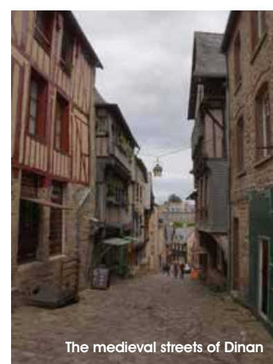
The medieval streets of Dinan