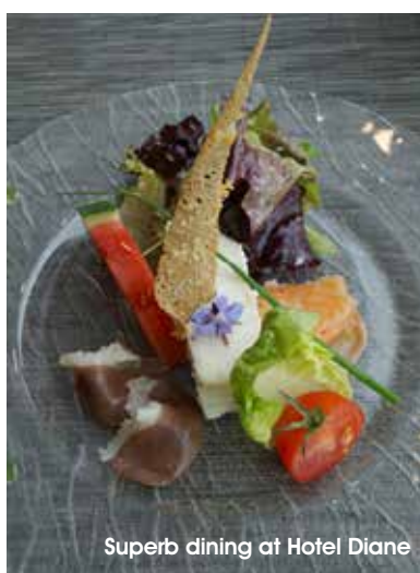
Superb dining at Hotel Diane