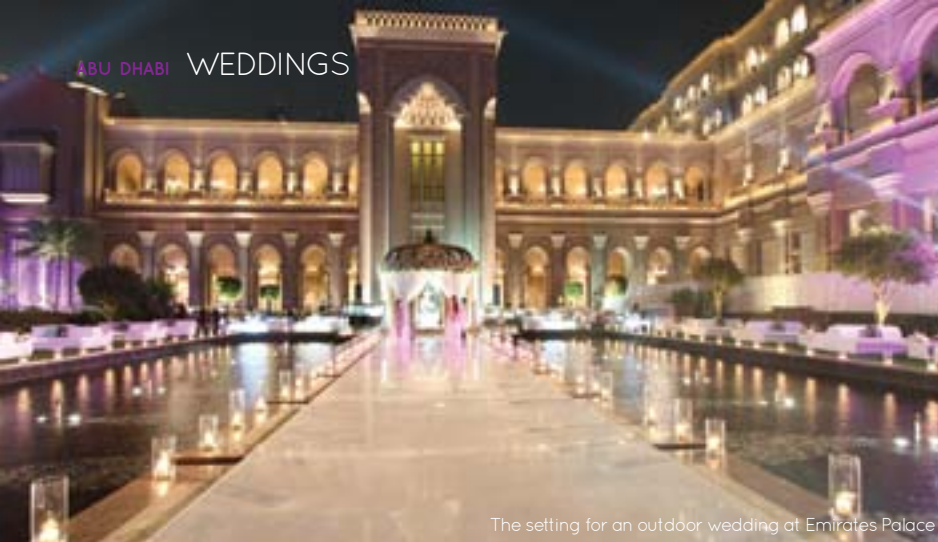
The setting for an outdoor wedding at Emirates Palace