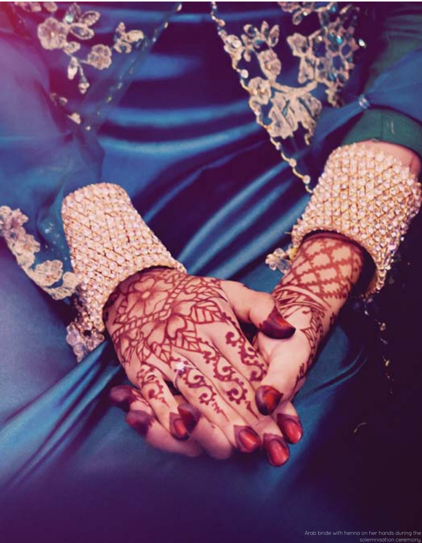
Arab bride with henna on her hands during the solemnisation ceremony.