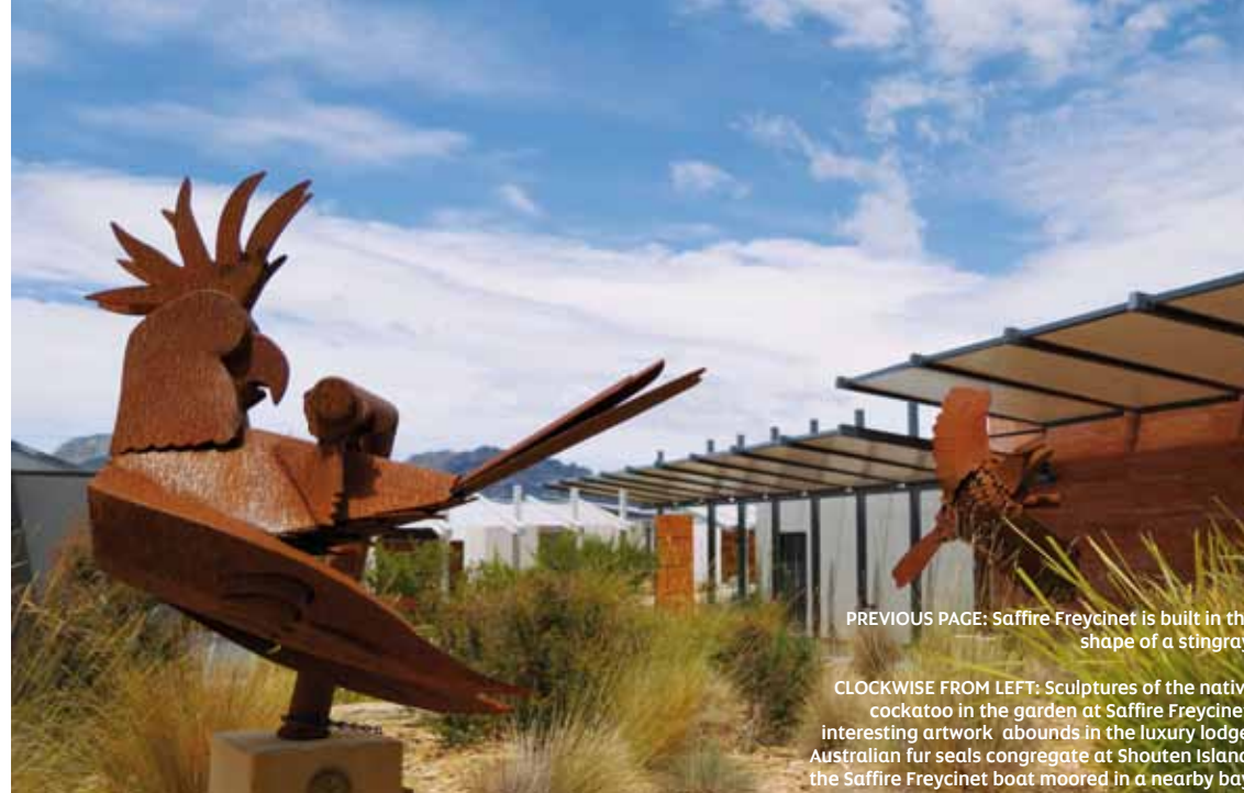
PREVIOUS PAGE: Saffire Freycinet is built in the shape of a stingray.