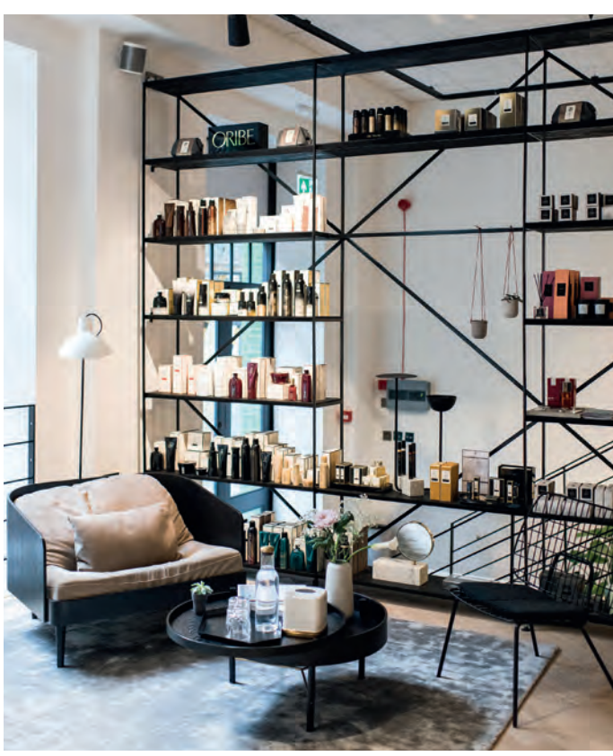
SMUK in Eccleston Yards

For more information about Eccleston Square Hotel, see www.ecclestonsquarehotel.com