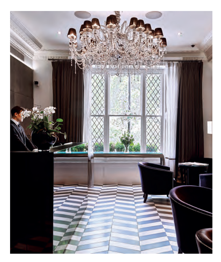
The reception at Eccleston Square Hotel

Instead, I idle back to Eccleston Square Hotel, enter hands-free, and tap the room lights on and curtains closed. I use the television to order a pot of tea, raise the upper section of the bed to a relaxed half-sitting position, and scroll through the channels. A cosy night in this comfortable spot seems like a far better plan.