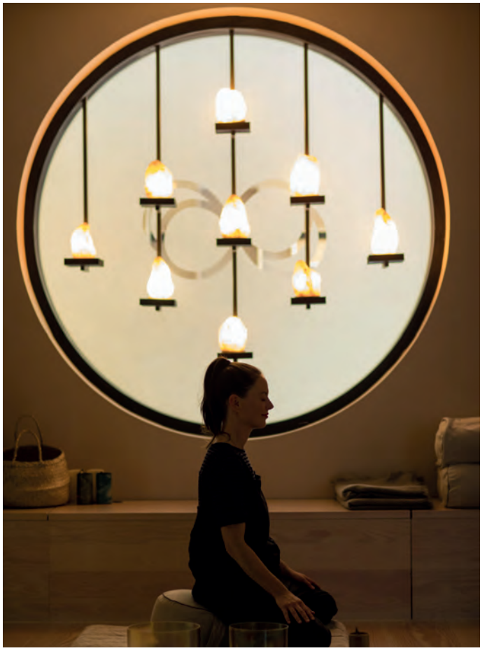
Meditation at Re:Mind