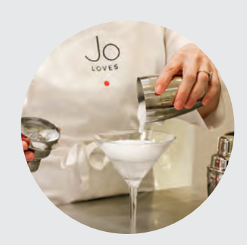
Fragrance Tapas at Jo Loves