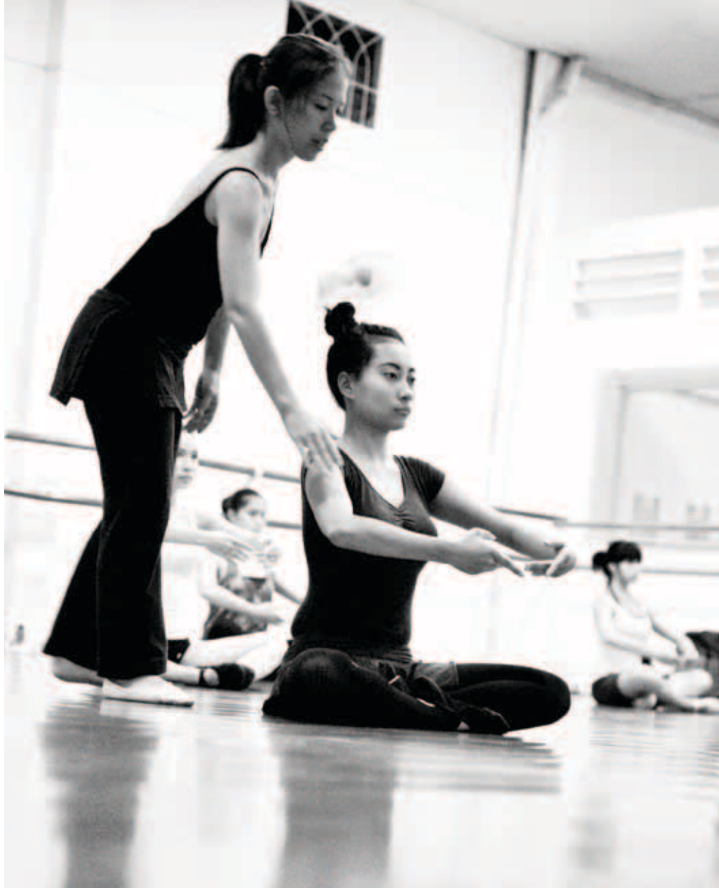
Students practising dance moves at DanCenter

the opposite for the women. We executed this without too many trampled toes, changing partners every few minutes. The guys learnt how to lead clockwise and anticlockwise turns, and the women learnt how to let the guys lead the turns. By the end of the class everyone had the basic steps and three moves. You can recap and practice the moves at their free introductory class every Wednesday at Caffè Molinari (Petrohouse Tower, 5 Le Duan, Q1).