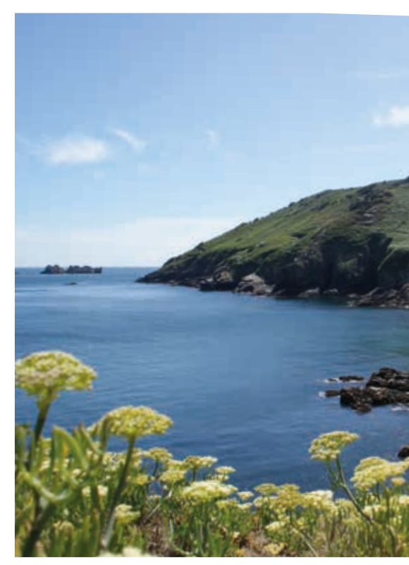
From top left: Clos a Jaon; Sark's coastline offers spectacular views; all of the cottages have stylish socialising spaces.

Stav at: Clos a Jaon www.closaiaonsark.com Eat at: Stocks Sark www.stockshotel.com Visit: La Seigneurie Gardens www.laseigneuriegardens.com Don't miss: Caragh Chocolates www.caraghchocolates.com For more information: Isle of Sark www.sark.co.uk