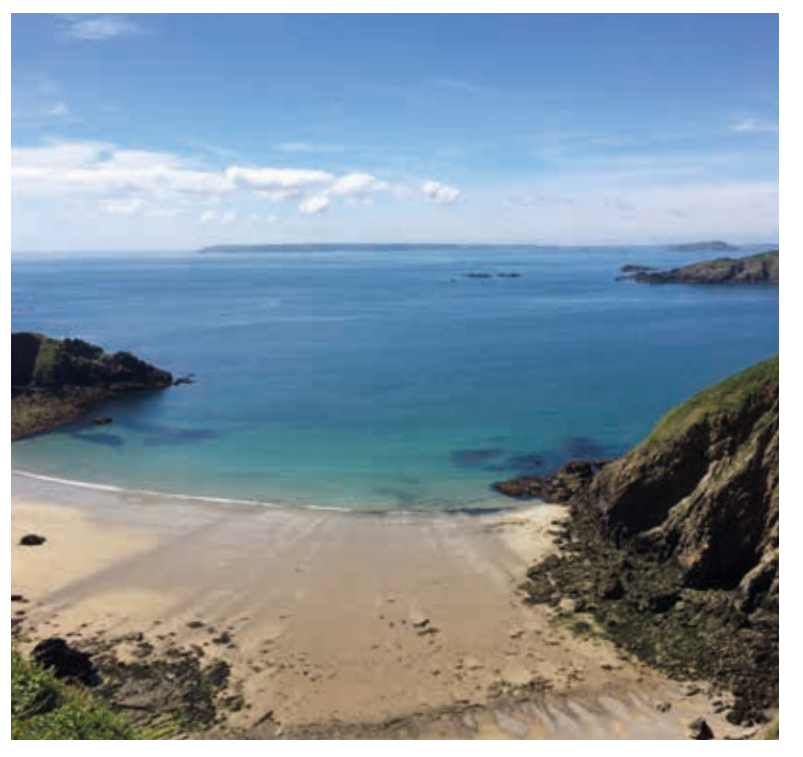
Main: La Coupée, the narrow isthmus that links Greater and Little Sark. Above from left: The largest beach on Sark, La Grande Greve; the gardens of the Seigneurie.

The smallest of the four main Channel Islands, Sark is located some 80 miles from the south coast of England and a mere 24 miles from the north coast of France, yet it's worlds apart from both. Giselle Whiteaker explores small-island living.