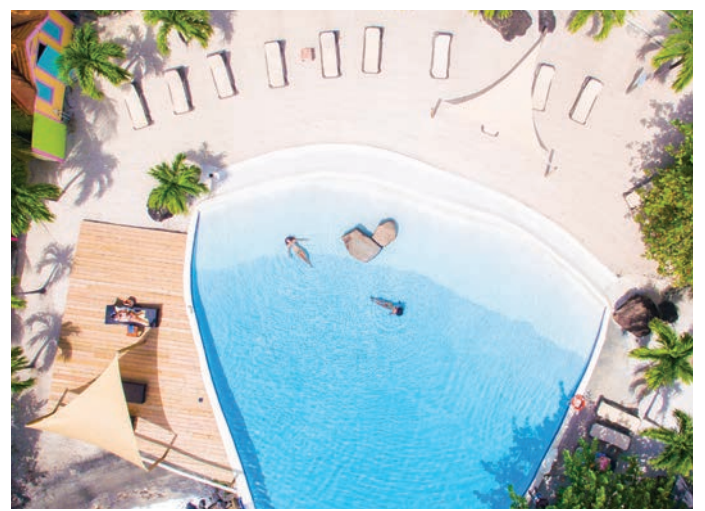
Clockwise from top: One of several pools at True Blue Bay Boutique Resort; the infinity pool; trees on Grand Anse Beach