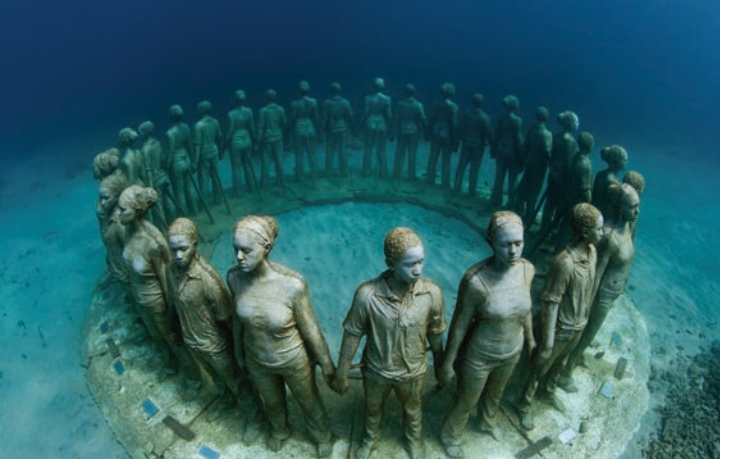
Sculpture at the Underwater Sculpture Park

The Sculpture Park is listed as one of National Geographic's 25 Wonders of the World for good reason.