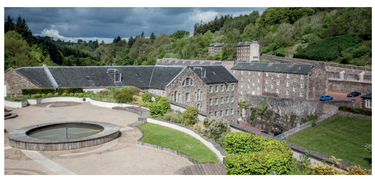
New Lanark from the rooftop garden

The restaurant seems to be doing well too – it's packed with punters this evening and the menu covers a range of dishes from traditional cullen skink to duck, orange and plum parfait and herb-crusted lamb cannon. The goats cheese and caramelised pearl onion savoury pancake is a definite winner and Judy has only good things to say about her slow-cooked shin of Scotch beef, served with smoked beetroot puree, colcannon mash, charred baby leeks, glazed Chantenay carrots and dressed with red wine jus and a parmesan crisp. The slice of moist carrot cake is also undeniably moreish.