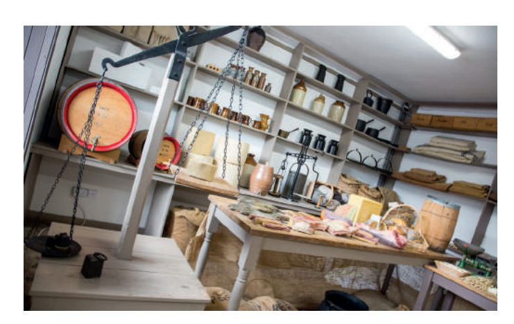
The Village Store

Driving through the gates as we depart New Lanark, we're pleased we came. Robert Owen's words ring in our ears: "The ever-changing scenes of nature afford not only the most economical, but also the most innocent pleasures which man can enjoy."