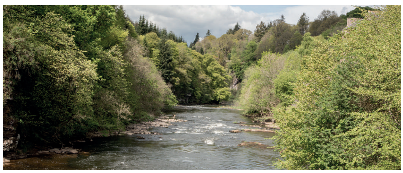
The River Clyde